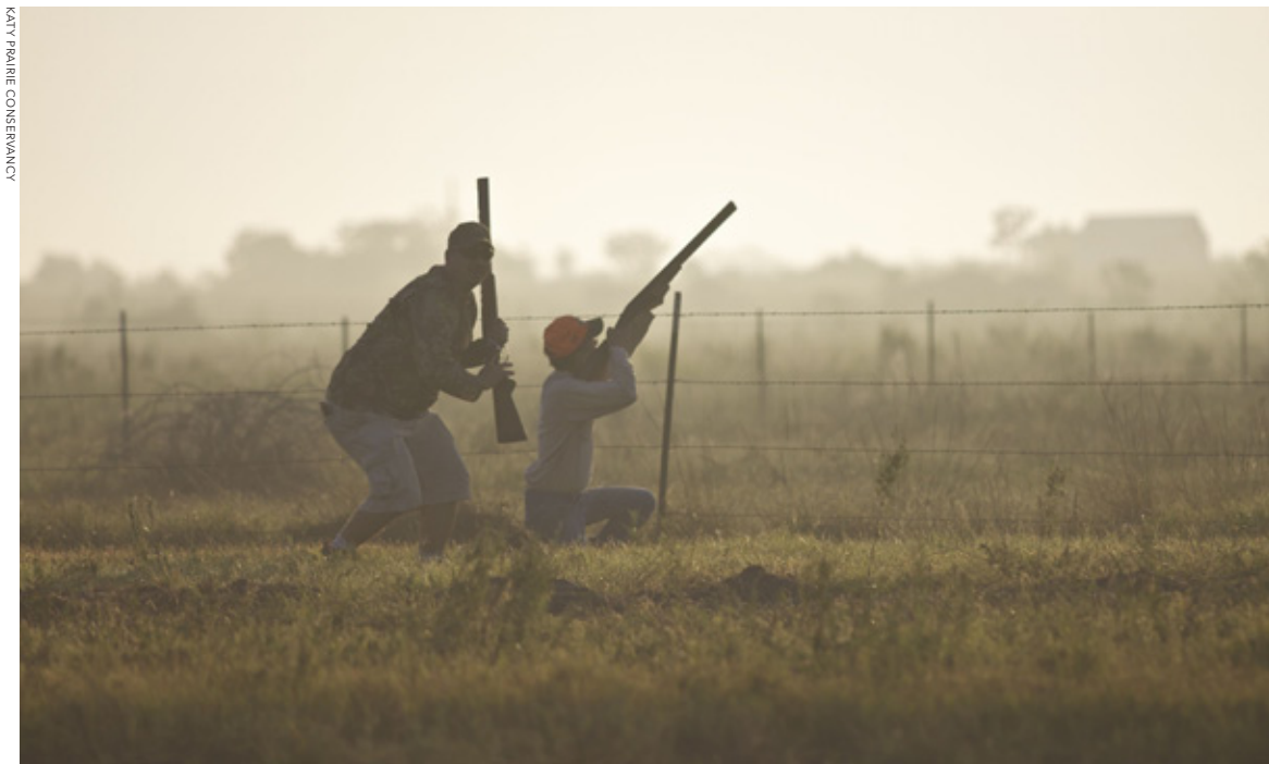
KATY PRAIRIE CONSERVANCY

Similar resources nearby in Texas have been the subject of economic inquiry. Birding, photography, hiking, kayaking, wildlife watching, and hunting are common activities on the proposed Lone State Coastal National Recreation Area in coastal Texas, which currently experiences 2.6 million visitors each year. A recent economic impact analysis found that